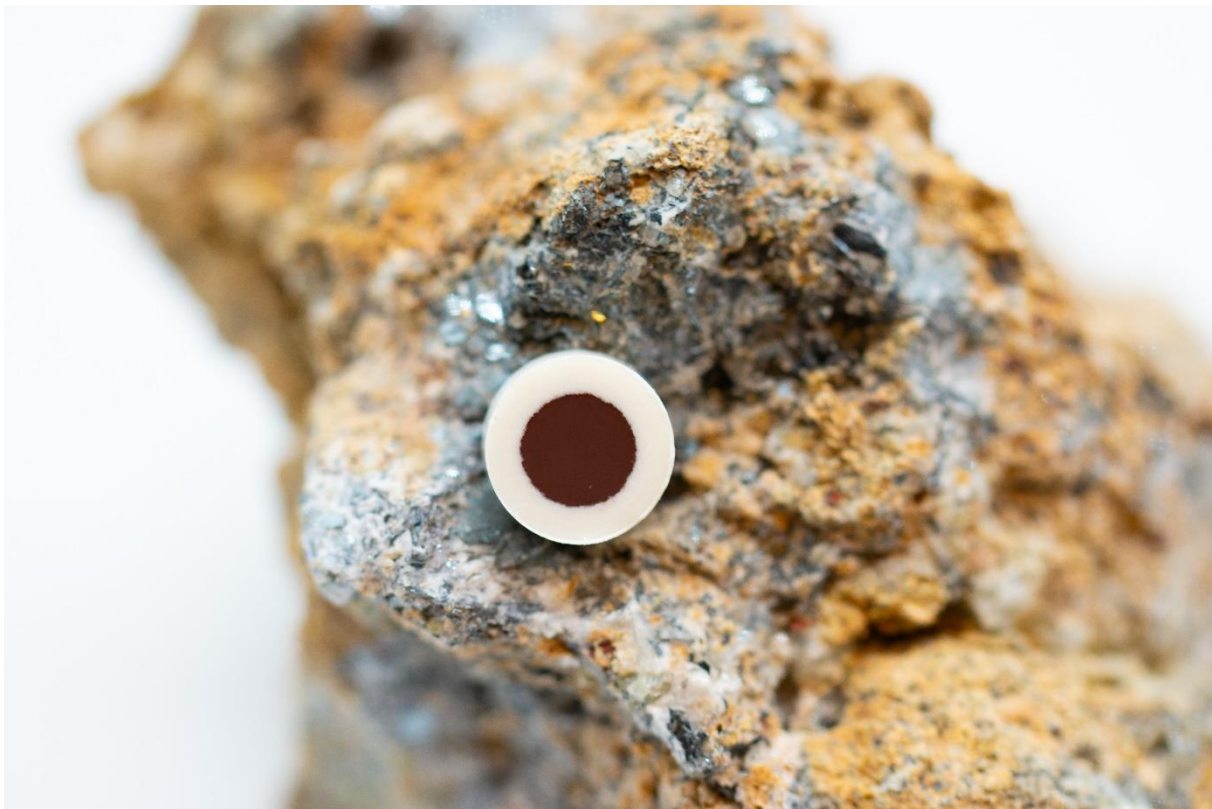
Fig. 1 Photograph of a hematite-mineralised ore and a HMIE-NP Nano-Pellet.

A total amount of 500 g crushed (5-40 \mu\text{m} ) hematite crystals was purchased from a mineral dealership (Fig.1).