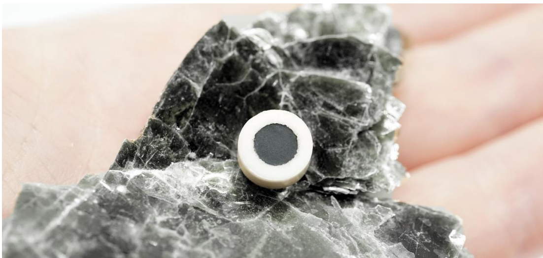
Fig. 1 Photograph of biotite crystals and a Nano-Pellet.

A total amount of 250 g biotite powder was purchased from a mineral dealership (Fig.1).