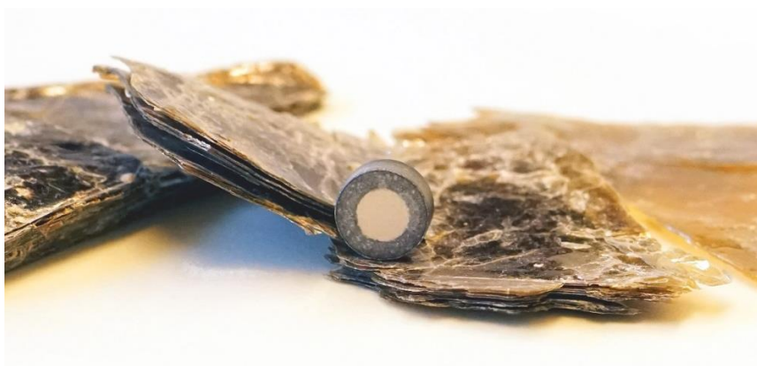
Fig. 1 Photograph of muscovite crystals and the resulting Nano-Pellet.

A total amount of 250 g muscovite crystals was purchased from a mineral dealership (Fig.1).